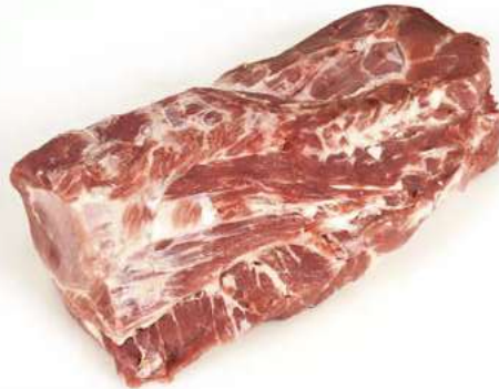
2 Trim of excess fat and cut into 20 mm steaks.