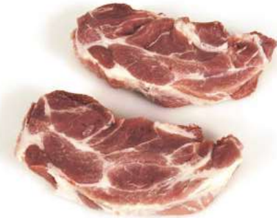
3 Collar Steaks.