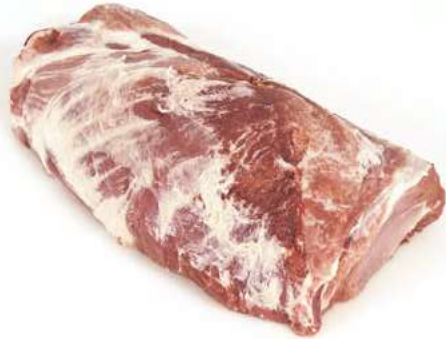
1 Boneless Collar.